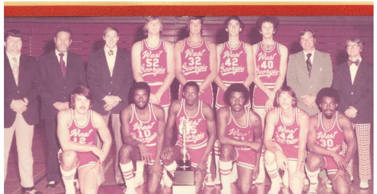
1974 NAIA National Championship Team