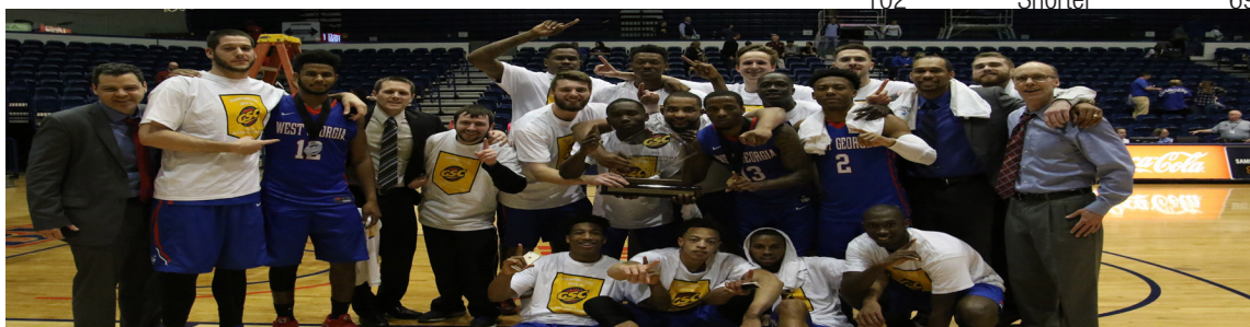
The 2015-16 Wolves won the GSC Tournament, defeating Alabama Huntsville 99-82 in the Championship Game.