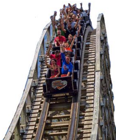
BAY BEACH AMUSEMENT PARK