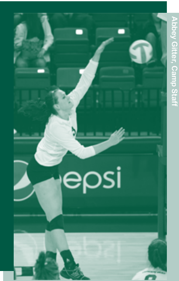
Abbey Gitter, Camp Staff