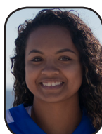
Sophomore, SS Orange Park, Fla.

2018 (Fr.): Played 35 games and made 34 starts as a freshman... Hit .303 with two doubles, a triple, two home runs and 16 RBIs... Had a 3-hit game in first career start, against Nova Southeastern (2/9), and she also had her first career run scored, RBI and stolen base in that game... Hit first career home run against Alabama Huntsville (3/25) in a 7-6 win... Had 6-game hitting streak from 3/24-4/7, hitting .450 with 9 hits, 5 RBIs, 3 multi-hit games and a home run in that time... Hit game-tying home run in sixth inning of GSC Tournament win over Delta State (5/4)... Had 6 multi-hit games on the year and three multi-RBI games.