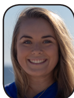
Senior, P Pensacola, Fla.

2018 (Jr.): Played 49 games, with 37 starts overall and 12 starts in the circle... Ranked third on the team with a 3.94 ERA, 5 wins, 65.2 innings pitched and 39 strikeouts... Hit .283 with six doubles and four home runs... Third on the team with 23 RBIs and fourth in slugging, at .472... Ranked second on the team with a .359 batting average with runners in scoring position and hit .309 with runners on... Held right-handed batters to a .244 average, and held all opponents to a .253 average with runners on base... Hit first career home run in home-opener against Union (3/3), and hit another home run in the following game against the Bulldogs... Had a pair of hits and two RBIs in second game of season, against Saint Leo (2/2)... Went 3-for-4 with 4 RBIs and a double against Barry (2/10)... Went 3-5 with 5 RBIs, 2 home runs, 4 runs scored in doubleheader against Union (3/3)... Had two multi-hit games in series against West Georgia... Had 8 multi-hit games on the year and 6 games with multiple RBIs... Threw 7.2 innings in extra-inning loss against Saint Leo (2/2) in her first start of the year, allowing just two earned runs... Fired six scoreless innings against Nova Southeastern (2/9), striking out five... Had a stretch of 14 consecutive scoreless innings from 3/3-17.