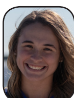
Freshman, UTIL Lake Butler, Fla.

High School: Played softball and volleyball at Union County HS... First Team All-State and the Florida Miss Softball Runner-Up in 2018... Hit .620 with a .671 OBP as a senior, and had a .674 OBP with 41 stolen bases as a sophomore in 2016... Prep Zone Player of the Year, First Team All-Area, and Offensive Player of the Year in 2017... Led team in batting average each year from 2015-17... Team won the 1A State Softball Championship in 2017 and were state runners-up in 2016.