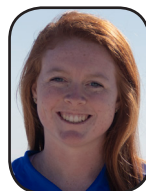
Sophomore, 1B Sarasota, Fla.

2018 (Fr.): Played in 27 games and made 11 starts... Had 5 RBIs, drew 5 walks, and scored 6 runs on the year... Had four-game hitting streak (2/3-10) to start her career, hitting .625 over her first 8 at-bats... Got first career hit and RBI against Tuskegee (2/3)... Had first career extra-base hit and stolen base against Nova Southeastern (2/9)... Picked up two multi-hit games as a freshman, against Barry (2/10) and West Alabama (2/17)... Hit .333 when coming off the bench... Hit .348 (8-23) with runners on base.