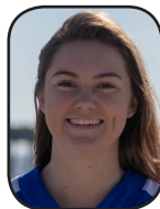
Junior, OF Cantonment, Fla.