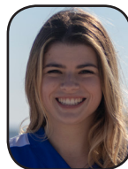
Junior, C Chino Hills, Calif.

2018 (So.): Played in 39 games and made 31 starts... Slugged .343 with 16 hits and 13 RBIs... Hit first career home run against Lee (4/7)... Started season with a six-game hitting streak, including a 2-hit game against No. 8 North Georgia... Added five doubles on the year, including in a pinch-hitting effort against Spring Hill (4/18)... Had two games with 3 RBIs, against Christian Brothers (3/12) and Lee (4/7)... Had .385 on-base percentage when leading off an inning.