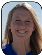
Sophomore, OF Bradenton, Fla.

2018 (Fr.): Appeared in 30 games as a freshman, hitting .273 and slugging .409... Had 3 RBIs, 4 runs scored and 3 doubles on the year... Scored first career run and recorded her first career stolen base against Palm Beach Atlantic (2/7)... Picked up first career hit -- a double -- against Union (3/4)... Went 1-for-2 with an RBI and a double against Christian Brothers (3/11)... Had pinch-hit single against Delta State in GSC Tournament (5/4)... Hit .364 as a pinch-hitter.