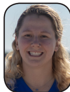
Freshman, IF Ponchatoula, La.

High School: Played volleyball, basketball, and softball as Ponchatoula HS... All-District Honorable Mention 2015, All-District First Team 2016 & 2017, All-State Honorable Mention 2016 & 2017, Class Team Academic All-State 2018... Won district championship in softball in 2015, and helped lead basketball team to a state championship in 2015 and district championships in 2015, 2017, and 2018.