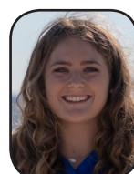
Sophomore, P Navarre, Fla.

2018 (TCC): Her first collegiate strikeout came in the TCC 2018 opener against St. Petersburg, where she threw 1 full inning, allowing 1 hit, 1 run, and 1 strikeout in her college debut (1.26)...threw the first 5.1 innings in game 2 against South Georgia State allowing 6 hits and 5 earned runs (2.20 ERA).