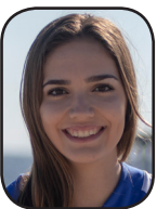
Junior, UTIL Odessa, Fla.

2018 (So.): Made 14 starts and played in 36 games... Hit .269 with 10 RBIs and a team-high 4 sacrifice flies... Hit .375 as a pinch-hitter and hit .353 (6-17) when coming off the bench... Had .571 on-base percentage when leading off an inning... Hit .333 with runners in scoring position and .300 with two outs... Had a pair of three-game hitting streaks on the year, from March 3-7 and from April 21-24... Had multi-hit game against Florida Southern (4/24)... Recorded two multi-RBI games, on 4/18 against Spring Hill and on 4/21 against Montevallo.