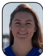
Junior, OF Cantonment, Fla.