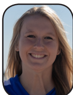
Sophomore, OF Bradenton, Fla.

2018 (Fr.): Appeared in 30 games as a freshman, hitting .273 and slugging .409... Had 3 RBIs, 4 runs scored and 3 doubles on the year... Scored first career run and recorded her first career stolen base against Palm Beach Atlantic (2/7)... Picked up first career hit -- a double -- against Union (3/4)... Went 1-for-2 with an RBI and a double against Christian Brothers (3/11)... Had pinch-hit single against Delta State in GSC Tournament (5/4)... Hit .364 as a pinch-hitter.