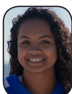
Sophomore, SS Orange Park, Fla.

2018 (Fr.): Played 35 games and made 34 starts as a freshman... Hit .303 with two doubles, a triple, two home runs and 16 RBIs... Had a 3-hit game in first career start, against Nova Southeastern (2/9), and she also had her first career run scored, RBI and stolen base in that game... Hit first career home run against Alabama Huntsville (3/25) in a 7-6 win... Had 6-game hitting streak from 3/24-4/7, hitting .450 with 9 hits, 5 RBIs, 3 multi-hit games and a home run in that time... Hit game-tying home run in sixth inning of GSC Tournament win over Delta State (5/4)... Had 6 multi-hit games on the year and three multi-RBI games.