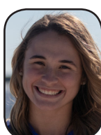
Freshman, UTIL Lake Butler, Fla.

High School: Played softball and volleyball at Union County HS... First Team All-State and the Florida Miss Softball Runner-Up in 2018... Hit .620 with a .671 OBP as a senior, and had a .674 OBP with 41 stolen bases as a sophomore in 2016... Prep Zone Player of the Year, First Team All-Area, and Offensive Player of the Year in 2017... Led team in batting average each year from 2015-17... Team won the 1A State Softball Championship in 2017 and were state runners-up in 2016.