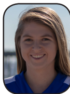
Sophomore, OF Jay, Fla.

2018 (Fr.): Appeared in 25 games and hit .200 as a freshman... Also slugged .400 and scored 12 runs... Scored first career run in season-opener against Nova Southeastern (2/2), and picked up first career hit -- a double -- against Christian Brothers (3/11).