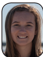
R-Freshman, C/1B Uniontown, Ohio