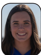
Freshman, OF Tallahassee, Fla.

High School: Hit over .300 every year at Lincoln HS, batting .362 with three home runs as a junior... Started every game in center field at LHS for three years... Member of the All-Big Bend second team in 2016-17, and a member of the All-State Academic Team in 2017-18... Team was a four-time runner-up in the District Championship.