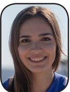
Junior, UTIL Odessa, Fla.

2018 (So.): Made 14 starts and played in 36 games... Hit .269 with 10 RBIs and a team-high 4 sacrifice flies... Hit .375 as a pinch-hitter and hit .353 (6-17) when coming off the bench... Had .571 on-base percentage when leading off an inning... Hit .333 with runners in scoring position and .300 with two outs... Had a pair of three-game hitting streaks on the year, from March 3-7 and from April 21-24... Had multi-hit game against Florida Southern (4/24)... Recorded two multi-RBI games, on 4/18 against Spring Hill and on 4/21 against Montevallo.