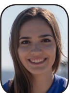
Junior, UTIL Odessa, Fla.

2018 (So.): Made 14 starts and played in 36 games... Hit .269 with 10 RBIs and a team-high 4 sacrifice flies... Hit .375 as a pinch-hitter and hit .353 (6-17) when coming off the bench... Had .571 on-base percentage when leading off an inning... Hit .333 with runners in scoring position and .300 with two outs... Had a pair of three-game hitting streaks on the year, from March 3-7 and from April 21-24... Had multi-hit game against Florida Southern (4/24)... Recorded two multi-RBI games, on 4/18 against Spring Hill and on 4/21 against Montevallo.