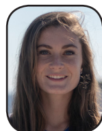
Senior, IF Orlando, Fla.

2016 NFCA First Team All-America 2-Time CoSIDA Academic All-District 2-Time All-Gulf South Conference 2-Time D2CCA All-South Region 2-Time NFCA All-South Region 2018 Gulf South Conference All-Academic Team 3-Time GSC Spring Academic Honor Roll ***Ranks 5th in UWF history in triples (16)***