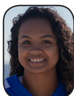
Sophomore, SS Orange Park, Fla.

2018 (Fr.): Played 35 games and made 34 starts as a freshman... Hit .303 with two doubles, a triple, two home runs and 16 RBIs... Had a 3-hit game in first career start, against Nova Southeastern (2/9), and she also had her first career run scored, RBI and stolen base in that game... Hit first career home run against Alabama Huntsville (3/25) in a 7-6 win... Had 6-game hitting streak from 3/24-4/7, hitting .450 with 9 hits, 5 RBIs, 3 multi-hit games and a home run in that time... Hit game-tying home run in sixth inning of GSC Tournament win over Delta State (5/4)... Had 6 multi-hit games on the year and three multi-RBI games.