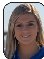
Sophomore, P Jacksonville, Fla.

2018 (Fr.; USC Upstate): Made 10 appearances, including 3 starts, as a freshman at USC Upstate... Had a 3-1 win-loss record... Posted a 3.04 ERA.