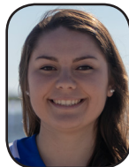
Junior, IF Navarre, Fla.

2018 (So.): Played in 48 games and made 44 starts, hitting .293... Led UWF in RBIs (32) and ranked second in slugging (.488), doubles (9), and home runs (4), while recording the third-most walks (21) and fourth-most total bases (60) on the team... Led team with 9 multi-RBI games and also had 7 multi-hit games... Had 10-game reached base streak from March 24-April 8, batting .458 and leading team in batting, hits (11), runs (9), doubles (3), home runs (3), RBIs (12), total bases (23), slugging (.958) and walks (10) in that time... Named GSC Player of the Week on March 27 after leading UWF in batting (.667), hits (6), home runs (2), RBIs (7), total bases (13), slugging (1.444) and on-base percentage (.727) in the UAH series and she had at least one extra-base hit and one RBI in each game of the series... Had .385 on-base percentage when leading off an inning... Hit .339 with runners in scoring position, .348 with two outs and led team with 12 two-out RBIs... Ranked fourth in the GSC in total fielding chances (290) and was fifth in fielding double plays (12) and putouts (270).