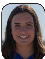
Freshman, OF Tallahassee, Fla.

High School: Hit over .300 every year at Lincoln HS, batting .362 with three home runs as a junior... Started every game in center field at LHS for three years... Member of the All-Big Bend second team in 2016-17, and a member of the All-State Academic Team in 2017-18... Team was a four-time runner-up in the District Championship.