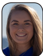
Senior, P Pensacola, Fla.

2018 (Jr.): Played 49 games, with 37 starts overall and 12 starts in the circle... Ranked third on the team with a 3.94 ERA, 5 wins, 65.2 innings pitched and 39 strikeouts... Hit .283 with six doubles and four home runs... Third on the team with 23 RBIs and fourth in slugging, at .472... Ranked second on the team with a .359 batting average with runners in scoring position and hit .309 with runners on... Held right-handed batters to a .244 average, and held all opponents to a .253 average with runners on base... Hit first career home run in home-opener against Union (3/3), and hit another home run in the following game against the Bulldogs... Had a pair of hits and two RBIs in second game of season, against Saint Leo (2/2)... Went 3-for-4 with 4 RBIs and a double against Barry (2/10)... Went 3-5 with 5 RBIs, 2 home runs, 4 runs scored in doubleheader against Union (3/3)... Had two multi-hit games in series against West Georgia... Had 8 multi-hit games on the year and 6 games with multiple RBIs... Threw 7.2 innings in extra-inning loss against Saint Leo (2/2) in her first start of the year, allowing just two earned runs... Fired six scoreless innings against Nova Southeastern (2/9), striking out five... Had a stretch of 14 consecutive scoreless innings from 3/3-17.