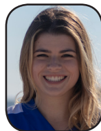
Junior, C Chino Hills, Calif.

2018 (So.): Played in 39 games and made 31 starts... Slugged .343 with 16 hits and 13 RBIs... Hit first career home run against Lee (4/7)... Started season with a six-game hitting streak, including a 2-hit game against No. 8 North Georgia... Added five doubles on the year, including in a pinch-hitting effort against Spring Hill (4/18)... Had two games with 3 RBIs, against Christian Brothers (3/12) and Lee (4/7)... Had .385 on-base percentage when leading off an inning.