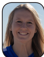
Sophomore, OF Bradenton, Fla.

2018 (Fr.): Appeared in 30 games as a freshman, hitting .273 and slugging .409... Had 3 RBIs, 4 runs scored and 3 doubles on the year... Scored first career run and recorded her first career stolen base against Palm Beach Atlantic (2/7)... Picked up first career hit -- a double -- against Union (3/4)... Went 1-for-2 with an RBI and a double against Christian Brothers (3/11)... Had pinch-hit single against Delta State in GSC Tournament (5/4)... Hit .364 as a pinch-hitter.