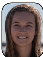
R-Freshman, C/1B Uniontown, Ohio