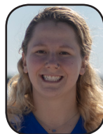
Freshman, IF Ponchatoula, La.

High School: Played volleyball, basketball, and softball as Ponchatoula HS... All-District Honorable Mention 2015, All-District First Team 2016 & 2017, All-State Honorable Mention 2016 & 2017, Class Team Academic All-State 2018... Won district championship in softball in 2015, and helped lead basketball team to a state championship in 2015 and district championships in 2015, 2017, and 2018.