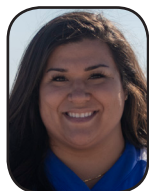
Senior, 1B Pensacola, Fla.

2018 NFCA All-South Region Second Team 2018 D2CCA All-South Region Second Team ***Leads all current UWF student-athletes with 105 career RBIs***