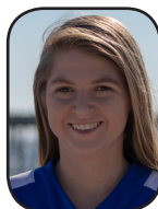
Sophomore, OF Jay, Fla.

2018 (Fr.): Appeared in 25 games and hit .200 as a freshman... Also slugged .400 and scored 12 runs... Scored first career run in season-opener against Nova Southeastern (2/2), and picked up first career hit -- a double -- against Christian Brothers (3/11).