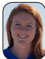
Sophomore, 1B Sarasota, Fla.

2018 (Fr.): Played in 27 games and made 11 starts... Had 5 RBIs, drew 5 walks, and scored 6 runs on the year... Had four-game hitting streak (2/3-10) to start her career, hitting .625 over her first 8 at-bats... Got first career hit and RBI against Tuskegee (2/3)... Had first career extra-base hit and stolen base against Nova Southeastern (2/9)... Picked up two multi-hit games as a freshman, against Barry (2/10) and West Alabama (2/17)... Hit .333 when coming off the bench... Hit .348 (8-23) with runners on base.