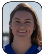
Junior, OF Cantonment, Fla.