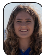
Sophomore, P Navarre, Fla.

2018 (TCC): Her first collegiate strikeout came in the TCC 2018 opener against St. Petersburg, where she threw 1 full inning, allowing 1 hit, 1 run, and 1 strikeout in her college debut (1.26)...threw the first 5.1 innings in game 2 against South Georgia State allowing 6 hits and 5 earned runs (2.20 ERA).