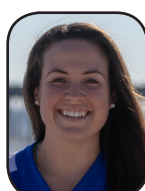
Junior, C St. Petersburg, Fla.

2018 (So.): Made 23 starts and played in 36 games behind the plate... Caught fifth-most base-stealers in Gulf South Conference (8) and had the third-best caught stealing percentage in the conference (25.8%)... Posted .357 on-base percentage... Recorded first career hit and RBI against Union (3/4)... Reached base four times against Spring Hill (3/7) after picking up a hit, drawing a walk and being hit by a pitch twice all in the same game.