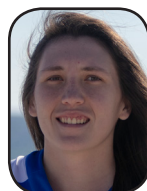
Senior, OF Pensacola, Fla.

2018: Played in 21 games, primarily as a pinch-runner... Scored 11 runs and posted a .333 on-base percentage... Went 2-for-2 in stolen base tries... Scored game-tying run in walkoff win over Alabama Huntsville on 3/25... Earned admission into the 2018 Engalitcheff Institute on Comparative Political and Economic Systems (ICPES) in Washington, D.C. for the summer semester.