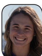
Freshman, UTIL Lake Butler, Fla.

High School: Played softball and volleyball at Union County HS... First Team All-State and the Florida Miss Softball Runner-Up in 2018... Hit .620 with a .671 OBP as a senior, and had a .674 OBP with 41 stolen bases as a sophomore in 2016... Prep Zone Player of the Year, First Team All-Area, and Offensive Player of the Year in 2017... Led team in batting average each year from 2015-17... Team won the 1A State Softball Championship in 2017 and were state runners-up in 2016.