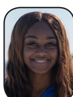
Junior, OF Pensacola, Fla.

2018 (So.): Started all 52 games for UWF in right field... Hit .318, which ranked third on the team, and led team with 29 stolen bases... Ranked sixth in the Gulf South Conference in steals... Ranked second on team with 48 hits... Tied for team lead with 3 outfield assists... Hit .379 with runners on base, .341 with runners in scoring position and .341 with two outs... Had UWF's longest hitting streak of the year, at 8 games... Hit .483 during 8-game hitting streak that lasted from 4/21-29 and led team in batting (.483), hits (14), total bases (15), on-base percentage (.516), multi-hit games (4), and steals (9) in that time... Did not commit an error all year... Was a perfect 21-for-21 in stolen base tries from March 24 through the end of the season... Hit .404 with 19 hits and 13 stolen bases in April... Ranked second on team with 13 multi-hit games... Hit .529 against left-handed pitching.