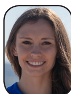
Sophomore, P Chipley, Fla.