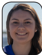
Junior, IF Navarre, Fla.

2018 (So.): Played in 48 games and made 44 starts, hitting .293... Led UWF in RBIs (32) and ranked second in slugging (.488), doubles (9), and home runs (4), while recording the third-most walks (21) and fourth-most total bases (60) on the team... Led team with 9 multi-RBI games and also had 7 multi-hit games... Had 10-game reached base streak from March 24-April 8, batting .458 and leading team in batting, hits (11), runs (9), doubles (3), home runs (3), RBIs (12), total bases (23), slugging (.958) and walks (10) in that time... Named GSC Player of the Week on March 27 after leading UWF in batting (.667), hits (6), home runs (2), RBIs (7), total bases (13), slugging (1.444) and on-base percentage (.727) in the UAH series and she had at least one extra-base hit and one RBI in each game of the series... Had .385 on-base percentage when leading off an inning... Hit .339 with runners in scoring position, .348 with two outs and led team with 12 two-out RBIs... Ranked fourth in the GSC in total fielding chances (290) and was fifth in fielding double plays (12) and putouts (270).