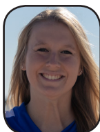
Sophomore, OF Bradenton, Fla.

2018 (Fr.): Appeared in 30 games as a freshman, hitting .273 and slugging .409... Had 3 RBIs, 4 runs scored and 3 doubles on the year... Scored first career run and recorded her first career stolen base against Palm Beach Atlantic (2/7)... Picked up first career hit -- a double -- against Union (3/4)... Went 1-for-2 with an RBI and a double against Christian Brothers (3/11)... Had pinch-hit single against Delta State in GSC Tournament (5/4)... Hit .364 as a pinch-hitter.