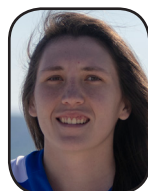
Senior, OF Pensacola, Fla.

2018: Played in 21 games, primarily as a pinch-runner... Scored 11 runs and posted a .333 on-base percentage... Went 2-for-2 in stolen base tries... Scored game-tying run in walkoff win over Alabama Huntsville on 3/25... Earned admission into the 2018 Engalitcheff Institute on Comparative Political and Economic Systems (ICPES) in Washington, D.C. for the summer semester.