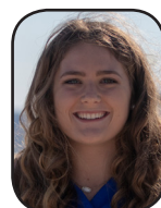
Sophomore, P Navarre, Fla.

2018 (TCC): Her first collegiate strikeout came in the TCC 2018 opener against St. Petersburg, where she threw 1 full inning, allowing 1 hit, 1 run, and 1 strikeout in her college debut (1.26)...threw the first 5.1 innings in game 2 against South Georgia State allowing 6 hits and 5 earned runs (2.20 ERA).