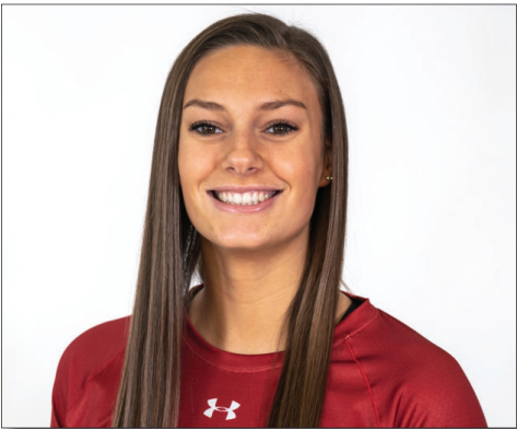
Instagram: @izzyashburn | Twitter: @izzyashburn2

“The chemistry between the team and coaching staff is unbeatable.”