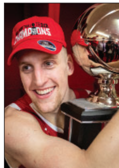
Wisconsin won the Big Ten regular season title for the 5th time since 2000, trailing only Michigan State (7) in that era.