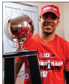
Wisconsin has won 10 straight at the Kohl Center and has won its last 17 home games against non-conference teams dating back to Dec. 13, 2017.