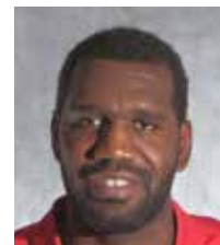
Greg Oden Student Assistant Coach 1st Year