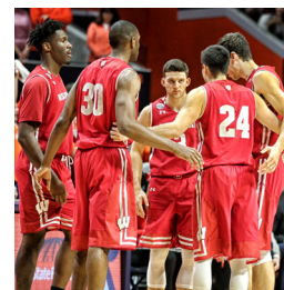
Wisconsin has clinched a winning record in Big Ten play for the 17th-consecutive season, the longest streak in conference history (pg 10).