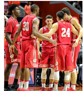
Wisconsin has clinched a winning record in Big Ten play for the 17th-consecutive season, the longest streak in conference history (pg 10).