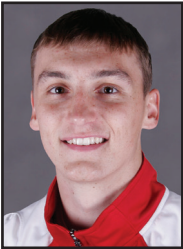
15 Sam Dekker F, So., 6-8, 220 Sheboygan, Wis.