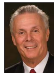
Bo Ryan Head Coach