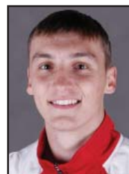
15 Sam Dekker F, So., 6-8, 220 Sheboygan, Wis.