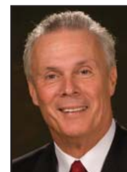
Bo Ryan Head Coach