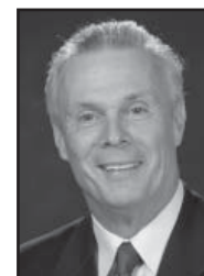
Bo Ryan Head Coach