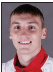
15 Sam Dekker F, So., 6-8, 220 Sheboygan, Wis.