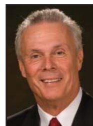
Bo Ryan Head Coach