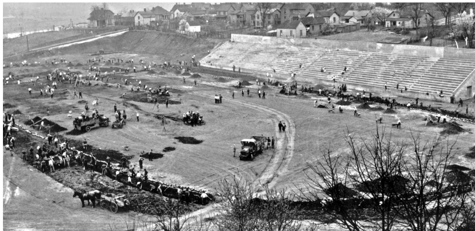
On March 16, 1921, all UT classes were dismissed to guarantee a workforce large enough to put the field into shape for a March 19 baseball game.

The beginning of the 1930s saw Tennessee play in its first bowl game, a 13-0 victory over New York University at Yankee