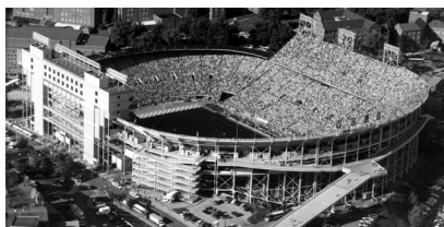
Neyland Stadium in 1992