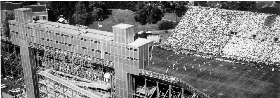
Neyland Stadium in 1962

While the addition of the state-of-the-art East Club