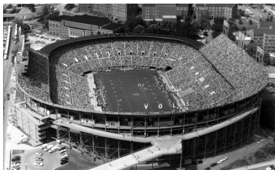
Neyland Stadium in 1980

Neyland Stadium provides an unparalleled college football experience, as evidenced by 20 consecutive sellouts entering the 2025 campaign. In 2023, Tennessee led the SEC and ranked top four in the nation in both average attendance (101,915) and accumulated attendance (713,405). UT has exhausted its football season ticket inventory for the third straight season with 70,500 purchased and a wait list of over 24,000. The 97.8 percent season ticket renewal rate for the 2025 campaign was a record high for the department.