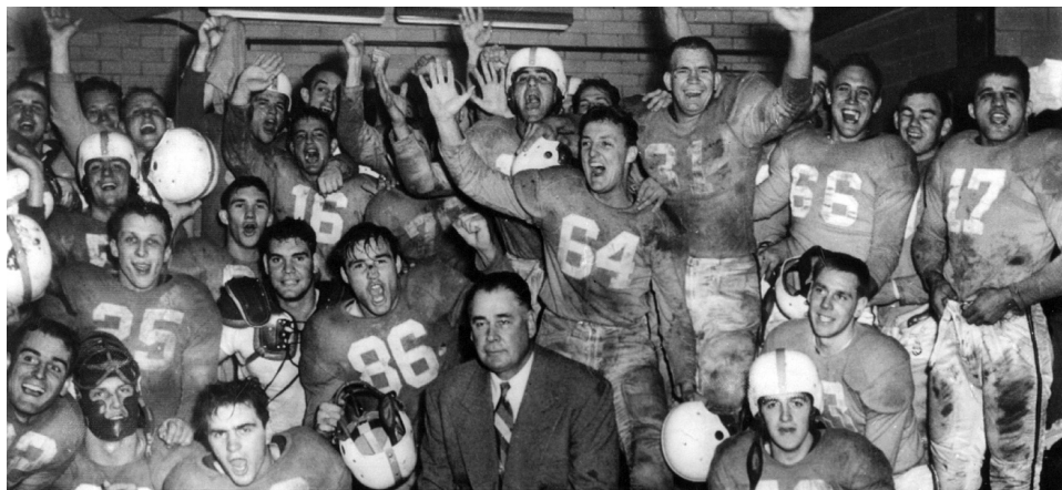
General Neyland with the Vols after the 1951 Cotton Bowl triumph over Texas.

crowd of more than 50,000 saw the Vols play Georgia Tech.