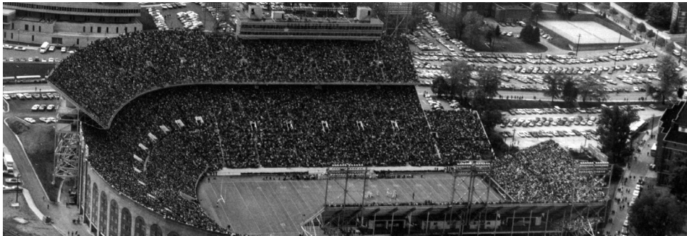
Neyland Stadium in 1972