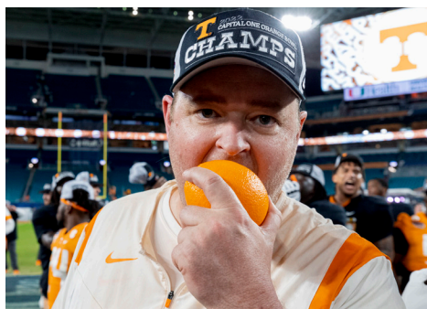
Josh Heupel was given the reins of the program on Jan. 27, 2021, and he's led the Vols to victories in the Orange and Citrus Bowls and lifted UT to its first College Football Playoff appearance in 2024.

Heupel's fifth season begins in 2025, a year that will see VFL great John Henderson become the 23rd UT player to be enshrined in the NFF College Football Hall of Fame.