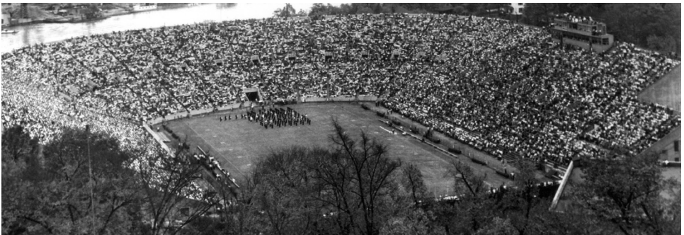
Shields-Watkins Field in 1948