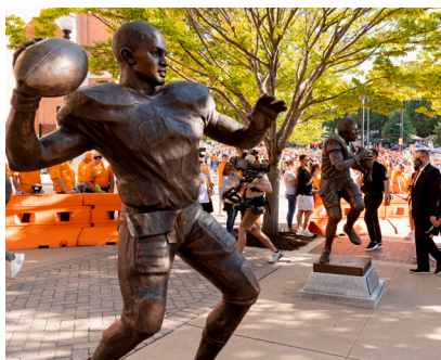
A statue plaza honoring four UT trailblazers debuted in 2021