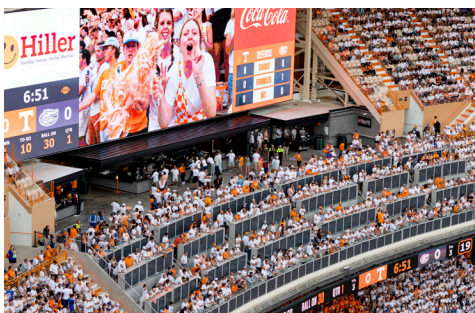
North End Zone Social Deck and videoboard debuted in 2022