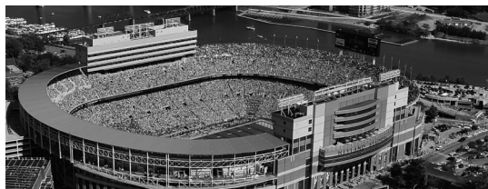
Neyland Stadium in 2010