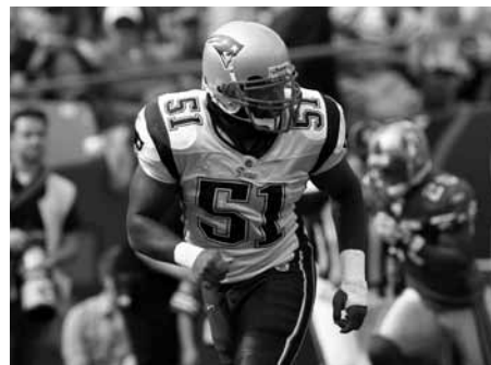
■ Jerod Mayo New England Patriots