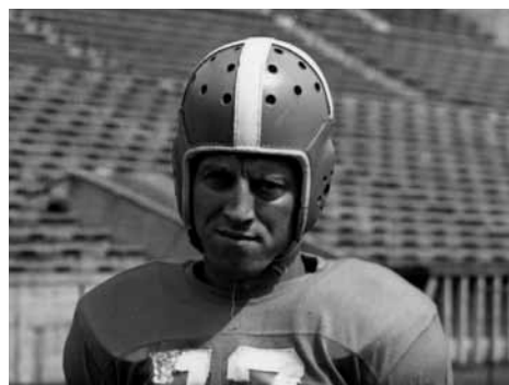
■ George Cafego Chicago Cardinals (1940 #1 Overall Draft Pick)