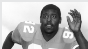
92 Reggie White Ceremony Oct. 1, 2005

In 2005, Tennessee instituted criteria to retire additional numbers. Those criteria include, but are not limited to: candidates must be recognized as good citizens and have a minimum of five years between the candidate's UT football career and consideration of this honor. A candidate must have achieved three of the following five collegiate honors: induction into the National Football Foundation and College Hall of Fame, Southeastern Conference (SEC) Player of the Year, Consensus All-America, Heisman Trophy winner, and have won one of the following general athletic/academic or non-position specific awards: Sullivan Award, SEC Athlete of the Year (all sports) or Draddy Award.