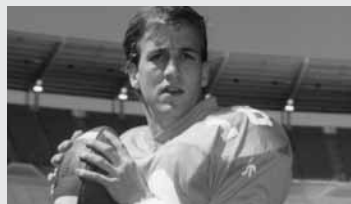
16 Peyton Manning Ceremony Oct. 29, 2005