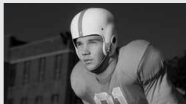
91 Doug Atkins Ceremony Nov. 19, 2005

Known as the "Minister of Defense," White went on to a 17-year pro football career, retiring as the NFL's all-time sack leader with 198. He was elected to the College Football Hall of Fame in 2002. He graduated from Tennessee in 1990.