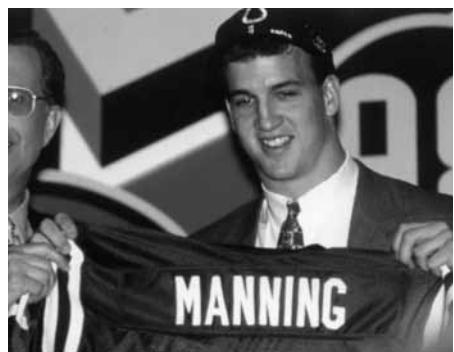
■ Peyton Manning Indianapolis Colts (1998 #1 Overall Draft Pick)