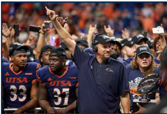
Jeff Traylor led UTSA to the 2021 Conference USA Championship, the first league crown in program history.

Prior to his time at Arkansas, Traylor spent the 2017 season as associate head coach and running backs coach at SMU under Chad Morris. He also served as the Mustangs' interim coach before joining Morris' staff at Arkansas.