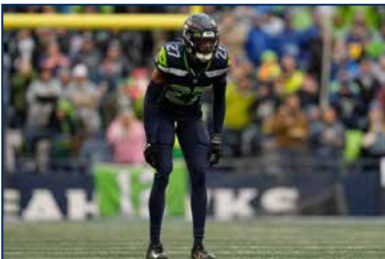
Tariq Woolen was selected by the Seattle Seahawks in the fifth round of the 2022 NFL Draft. The cornerback was named to the Pro Bowl after sharing the league lead in interceptions with six as a rookie.