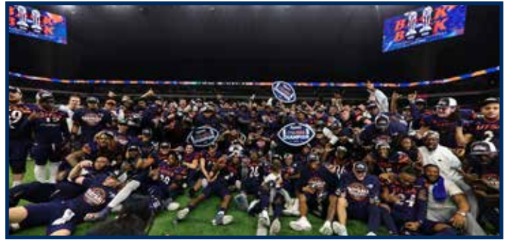
UTSA captured its second straight conference championship after defeating North Texas, 48-27, in the 2022 Conference USA Championship Game at the Alamodome.