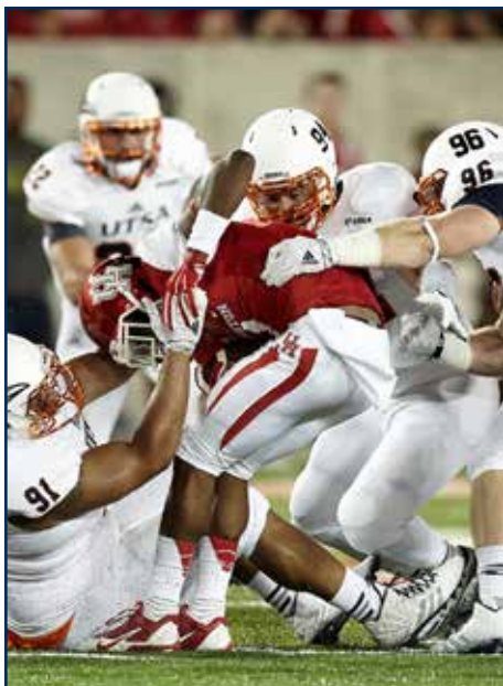
The Roadrunners defense held Houston to minus-26 rushing yards, the fewest allowed by UTSA in a game, in a 27-7 road victory in the 2014 season opener.