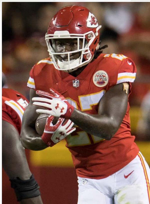
Kareem Hunt led the NFL in rushing in 2017.