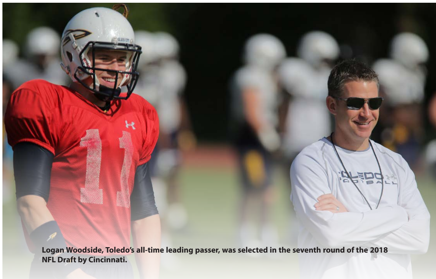
Logan Woodside, Toledo's all-time leading passer, was selected in the seventh round of the 2018 NFL Draft by Cincinnati.