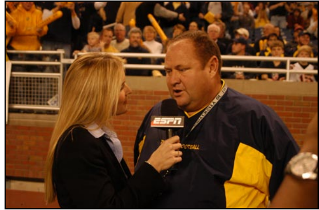
The Rockets have been on one of the ESPN channels 31 times since 2000.