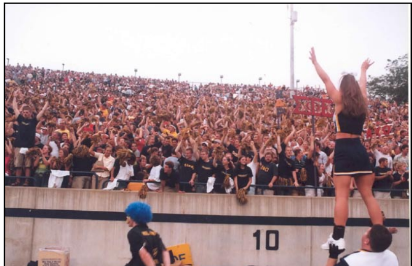
Toledo broke the MAC record for average attendance with 30,014 in 2001.