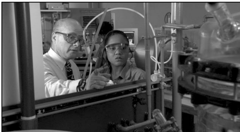
University of Toledo students learn from more than 2,500 full-time and part-time professors and instructors.

Pharmacology Medicinal and Biological Chemistry Pharmacy Practice Center for Applied Pharmacology (CAP) Center for Drug Design and Development (CD3)