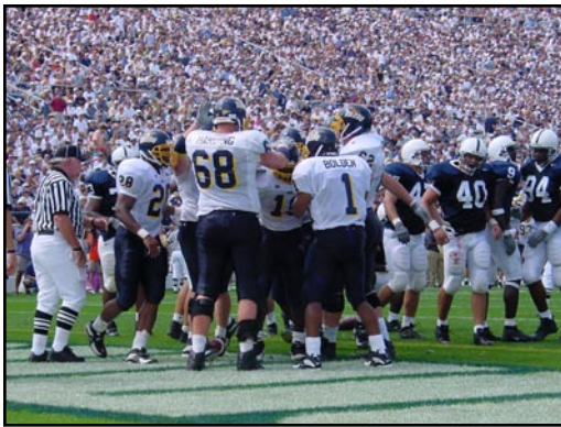
Toledo beat Penn State, 24-6, at Happy Valley in 2000.