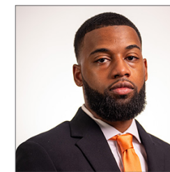
ASSISTANT COACH REGGIE MILLER