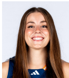
G | 5-8 | SO.. BARCELONA, SPAIN