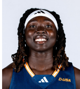
G | 5-11 | JR. KAMPALA, UGANDA