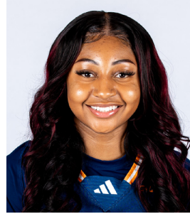
G | 5-17 | SR. SACRAMENTO, CALIF.