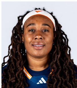
G | 5-6 | SR. CEDAR HILL, TEXAS