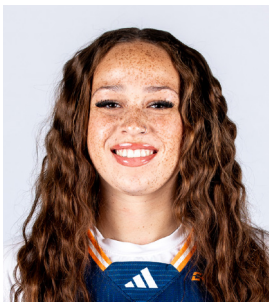
G/F | 6-0 | FR. MANSFIELD, TEXAS