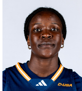
F | 6-1 | SO. ARUA, UGANDA