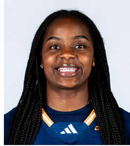
G | 5-8 | GR. MAPUTO, MOZAMBIQUE