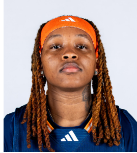
G | 5-8 | SR. BROOKLYN, N.Y.