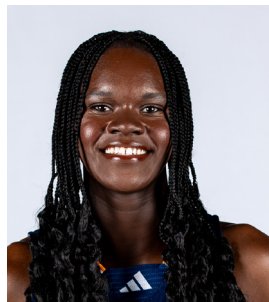
F | 6-4 | SO. MADRID, SPAIN