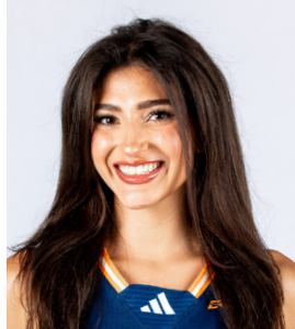
G | 5-8 | JR. SAN JOSE, CALIF.