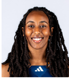
G | 5-6 | GR. ROSEVILLE, MINN