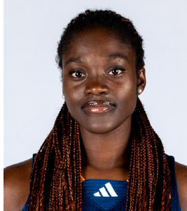
F | 6-2 | FR. MADRID, SPAIN.