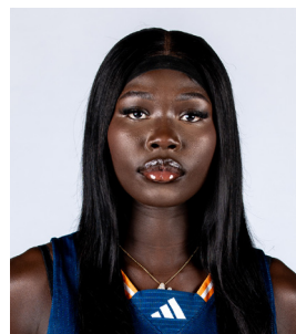
F | 6-3 | SR. BERGAMO, ITALY