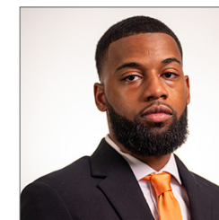
ASSISTANT COACH REGGIE MILLER