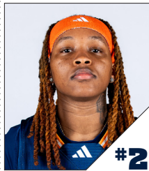
SIRVIVA LEGIONS SR. | GUARD | 5-8

9.8 PPG 5.8 RPG 1.4 APG 36.9 FG% 23.1 3PT% 53.4 FT%