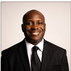
ASSISTANT COACH EARL BOYKINS EASTERN MICHIGAN '98