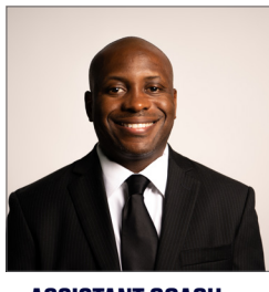
ASSISTANT COACH EARL BOYKINS