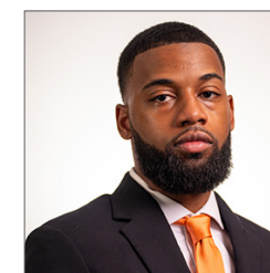
ASSISTANT COACH REGGIE MILLER