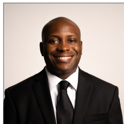
ASSISTANT COACH EARL BOYKINS