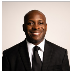
ASSISTANT COACH EARL BOYKINS