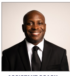
ASSISTANT COACH EARL BOYKINS