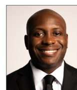
ASSISTANT COACH EARL BOYKINS