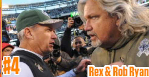
#4 Rex & Rob Ryan