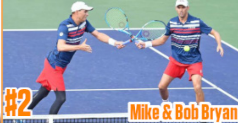
#2 Mike & Bob Bryan