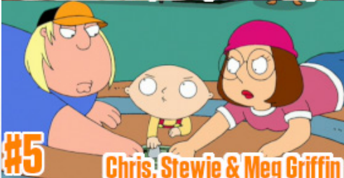
#5 Chris, Stewie & Meg Griffin