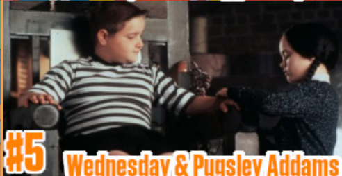
#5 Wednesday & Pugsley Addams