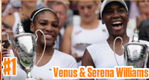
#1 Venus & Serena Williams