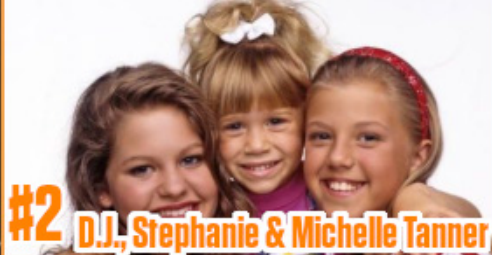
#2 D.J., Stephanie & Michelle Tanner