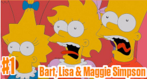
#1 Bart, Lisa & Maggie Simpson