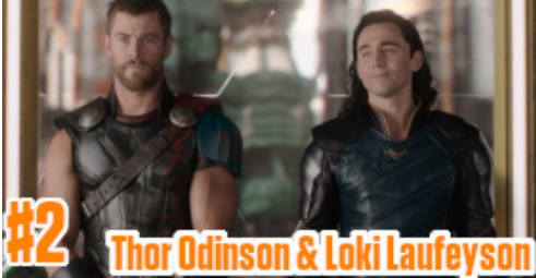
#2 Thor Odinson & Loki Laufeyson