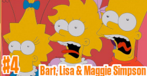
#4 Bart, Lisa & Maggie Simpson