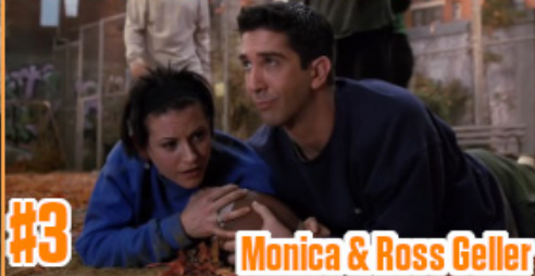
#3 Monica & Ross Geller