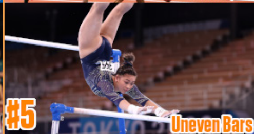
#5 Uneven Bars