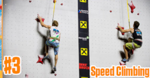
#3 Speed Climbing