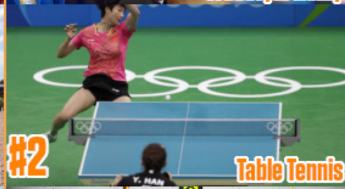
#2 Table Tennis