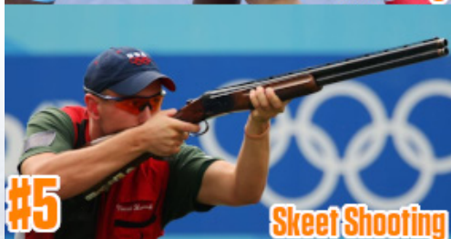
#5 Skeet Shooting