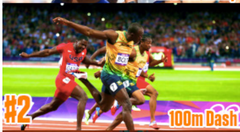
#2 100m Dash