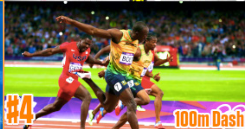
#4 100m Dash