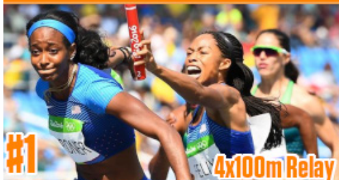
#1 4x100m Relay