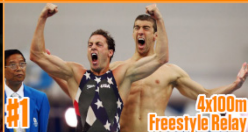
#1 4x100m Freestyle Relay