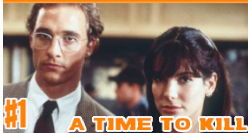
#1 A TIME TO KILL