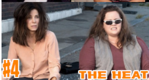
#4 THE HEAT