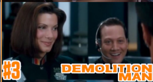
#3 DEMOLITION MAN