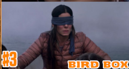
#3 BIRD BOX