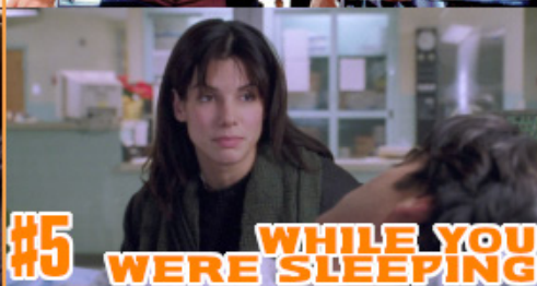
#5 WHILE YOU WERE SLEEPING