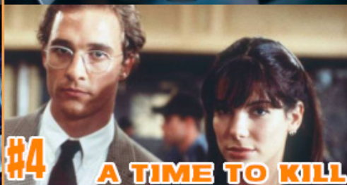
#4 A TIME TO KILL