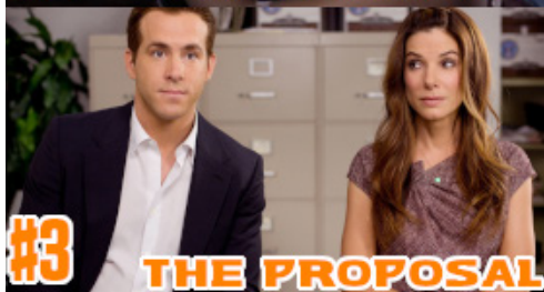
#3 THE PROPOSAL