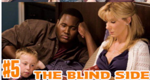
#5 THE BLIND SIDE