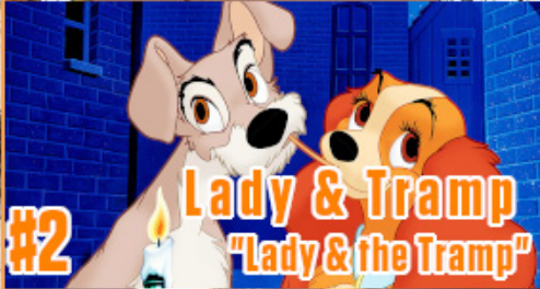
Lady & Tramp "Lady & the Tramp"