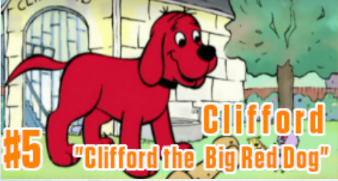
Clifford "Clifford the Big Red Dog"