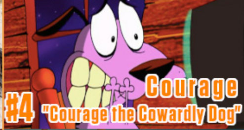
Courage "Courage the Cowardly Dog"