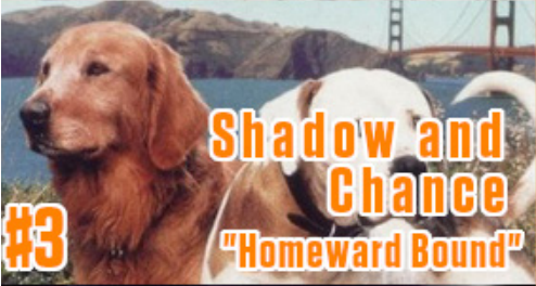
Shadow and Chance "Homeward Bound"