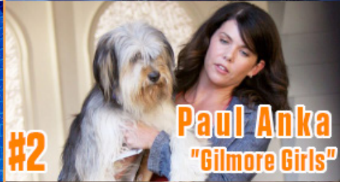
Paul Anka "Gilmore Girls"