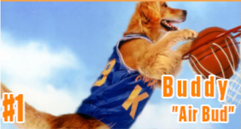
Buddy "Air Bud"