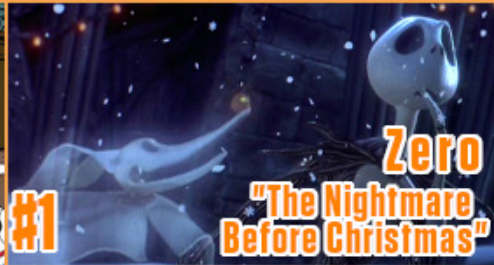
Zero "The Nightmare Before Christmas"