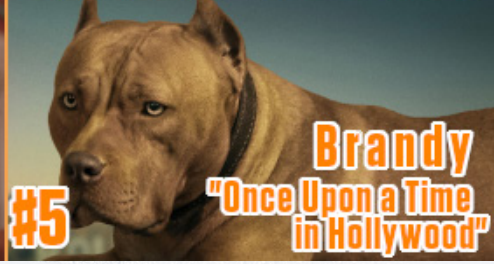
Brandy "Once Upon a Time in Hollywood"