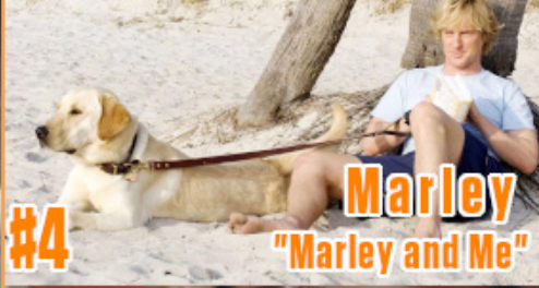
Marley "Marley and Me"