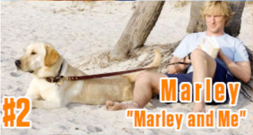
Marley "Marley and Me"