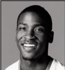
Michael Kidd- Gilchrist