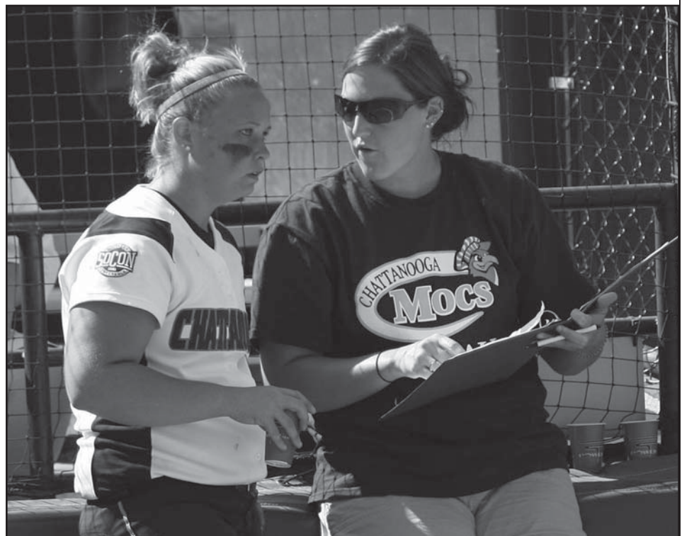
2009 Lady Mocs Softball