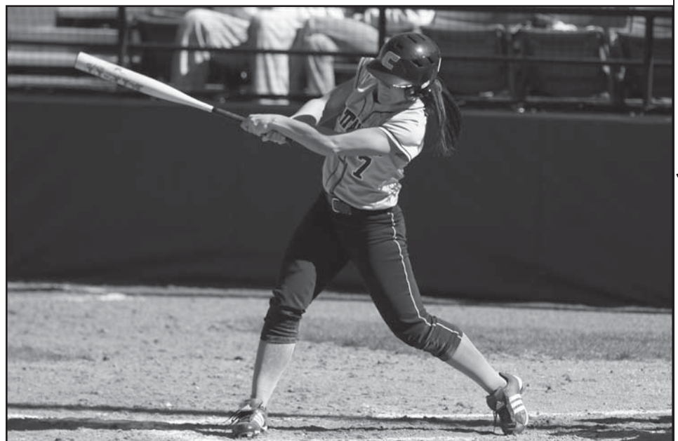
2009 Lady Mocs Softball