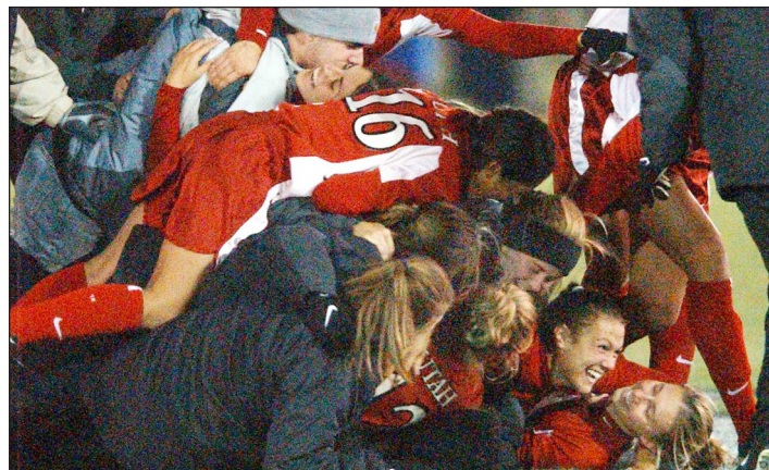
Utah celebrated its first-ever NCAA Tournament win in 2002. It was also the team's first-ever victory against rival BYU on the Cougars' home field.