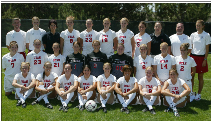
Utah swept the Mountain West Conference championships in 2003, winning both the MWC regular-season and tournament titles.