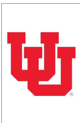
25 | Néné Sow C • 6-8 • So. Brussels, Belgium