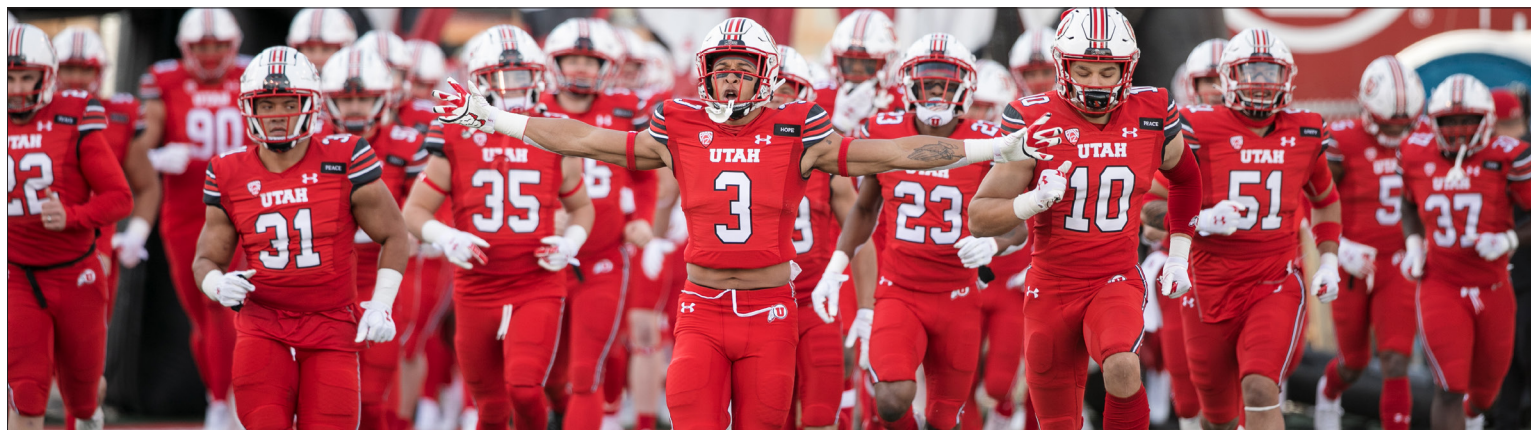
Utah finished the 2020 season ranked first in the Pac-12 in time of possession (166:39 total, 33:19 average).