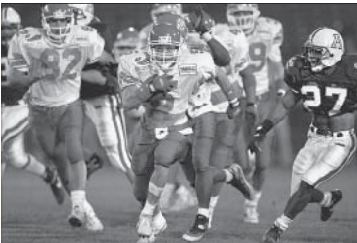
The Utes finished No. 10 and No. 8 in the two major polls after defeating Arizona in the 1994 Freedom Bowl.