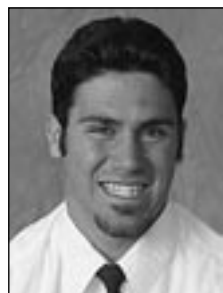
32 ERIC WEDDLE Defensive Back 6-0, 200, Sr. 3VL Alta Loma, Calif. Alta Loma HS