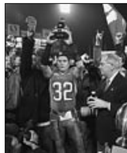
All-America candidate Eric Weddle.