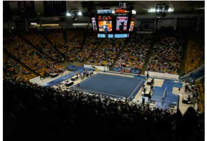
DEE GLEN SMITH SPECTRUM