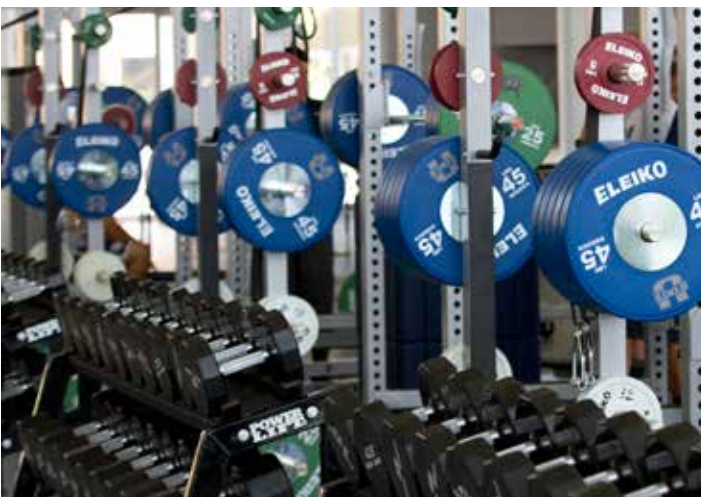
ICON SPORTS PERFORMANCE CENTER