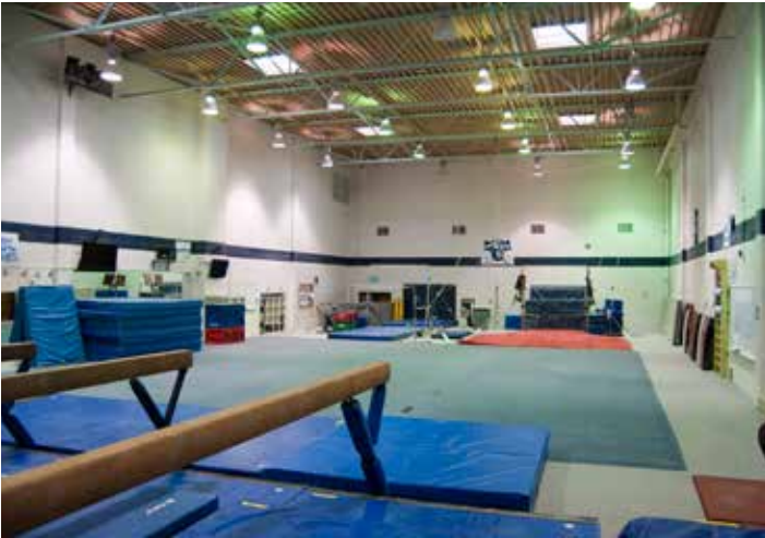
GYMNASTICS PRACTICE FACILITY