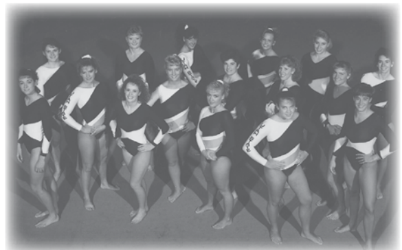
The 1991 USU team finished 12th at the NCAA Championships.