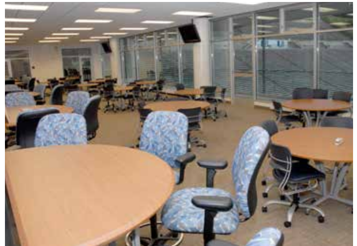
JIM AND CAROL LAUB ATHLETICS-ACADEMICS COMPLEX STUDY AREA