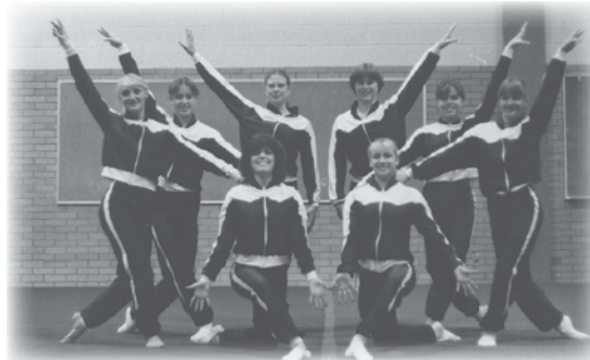
The 1982 team posted the highest national finish in Utah State history, as the Aggies took ninth at AIAW Nationals.