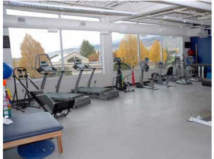
DR. JOHN WORLEY SPORTS MEDICINE RESEARCH COMPLEX