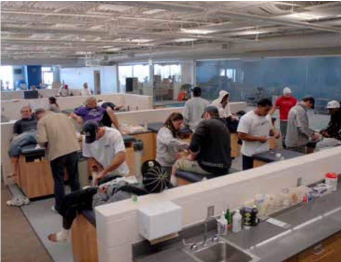
DALE MILDENBERGER SPORTS MEDICINE COMPLEX