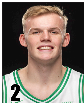
Holcombe's Complete bio