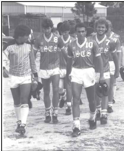
The early 1980's men's soccer teams laid the foundation for future generations of Spartan soccer. Upstate finished third three straight years in the NAIA National Tournament from 1983-85.