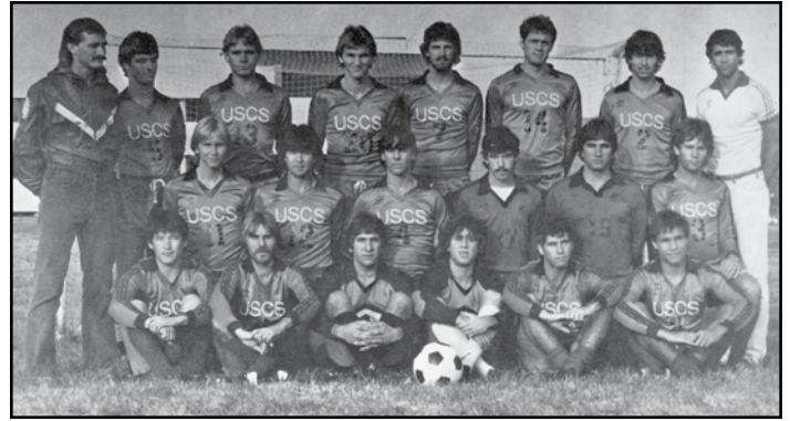
The 1983 team was the first men's soccer team at Upstate to advance to the postseason, finishing third at the NAIA National Tournament in Fresno, Calif.

the second-best mark in school history and stood as the standard bearer for 15 years until the 1998 squad bettered the mark with a .958 winning percentage (23-1-0). The 1983 squad began a string of three consecutive third-place finishes in the national tournament as the 1984 and 1985 teams also advanced to the Final Four. The 1984 team finished with a 16-3-3 record (.796), while the 1985 squad was 15-5-0 (.750).